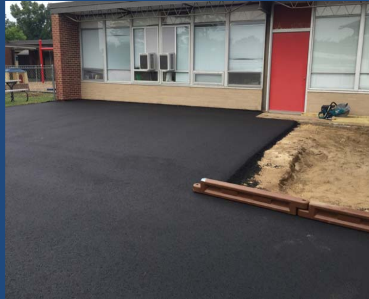
Ripley Preschool Playground Area