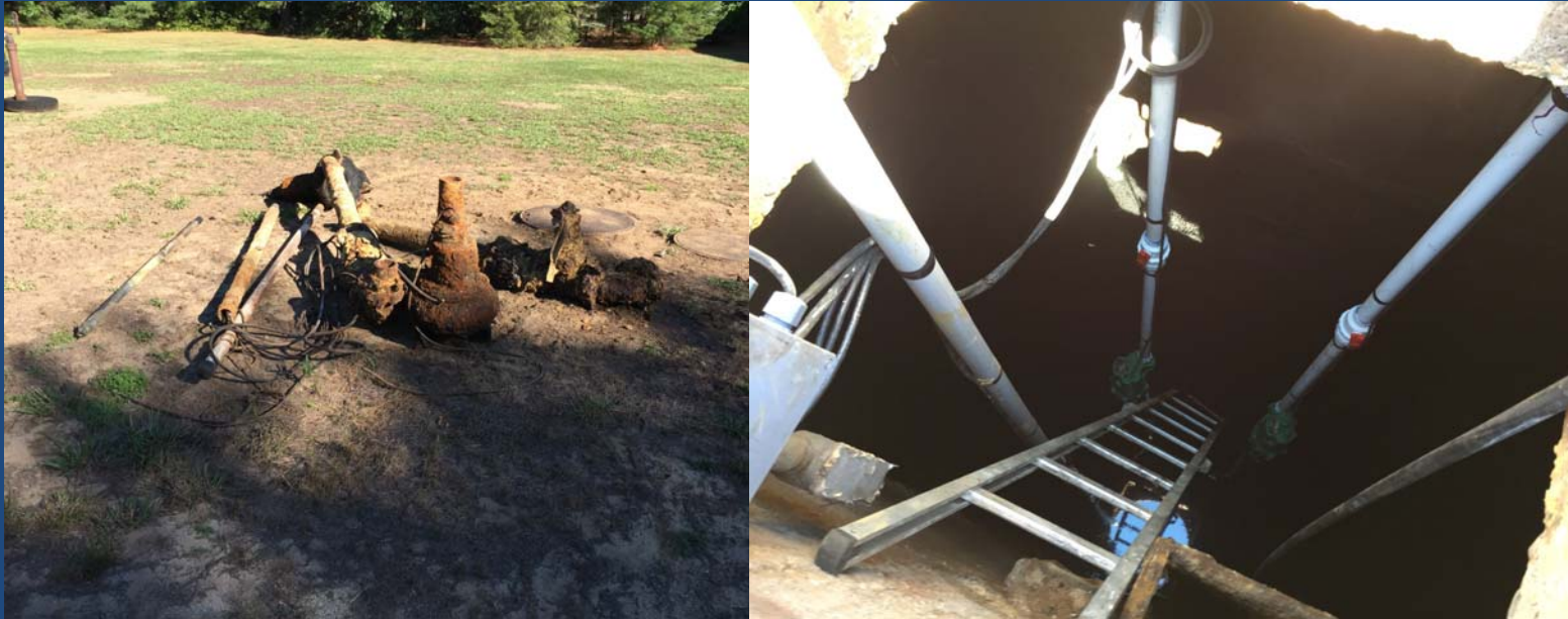
Sanborn Sewer Ejector Pump