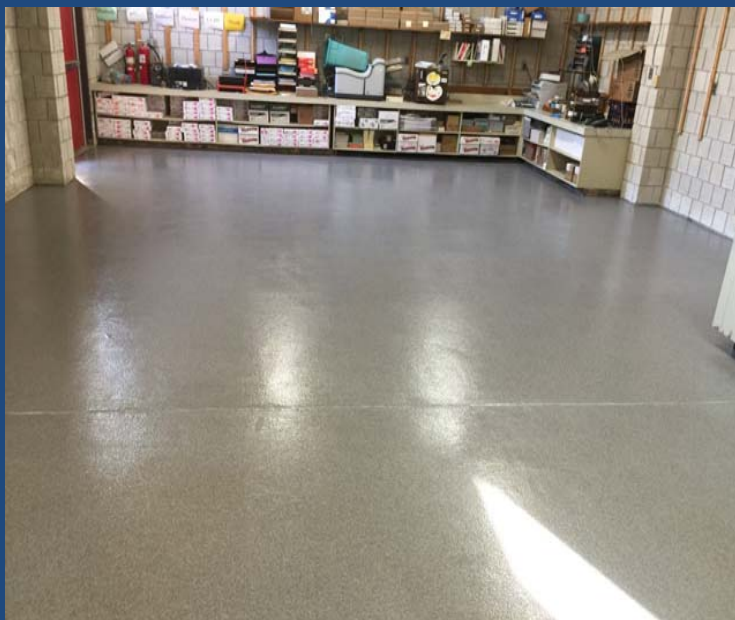
Ripley Copy Center Asbestos Flooring Replacement