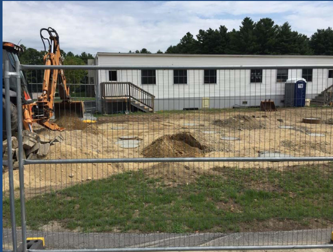
Sanborn Modular Classrooms Installed