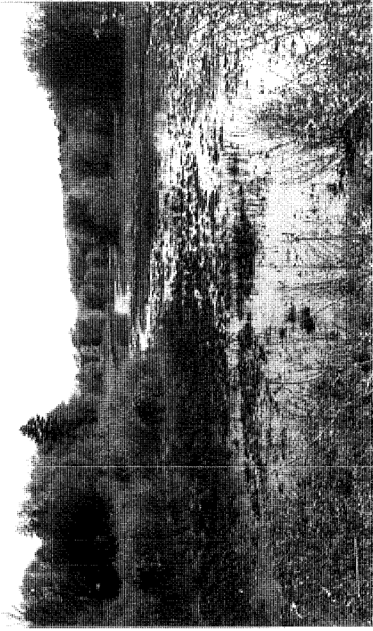
Assabet River at Westvale, Looking West from Damen Mill