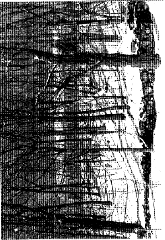
The Mill Block, Feb. 1988