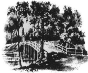
OLD NORTH BRIDGE

TOWN OF CONCORD TOWN HOUSE - P.O. BOX 535 CONCORD, MASSACHUSETTS 01742