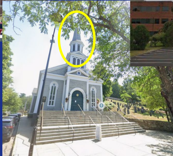
site plan review