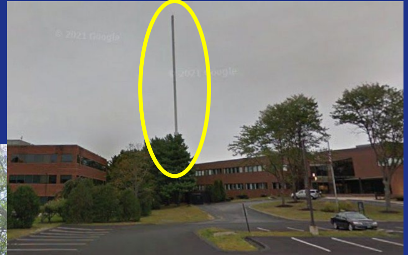
Art. 35 Wireless Bylaw