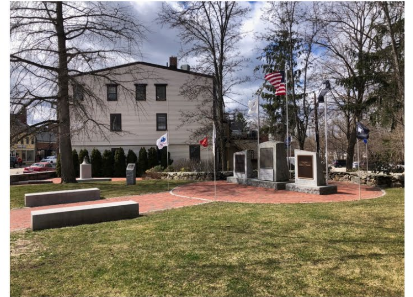
World War II, Korean War, Dominican Civil War, Vietnam War, Iraq War