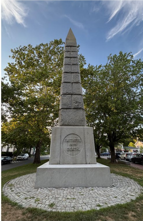
Civil War (The Soldiers' Monument)