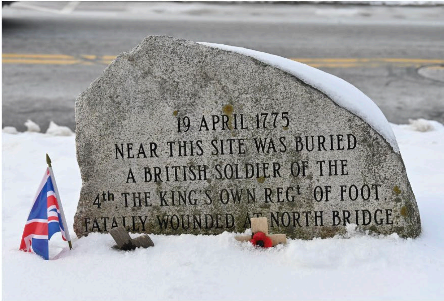
near Monument Square