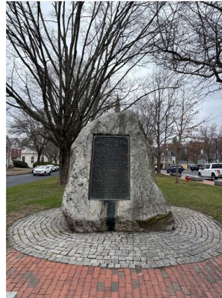
World War I