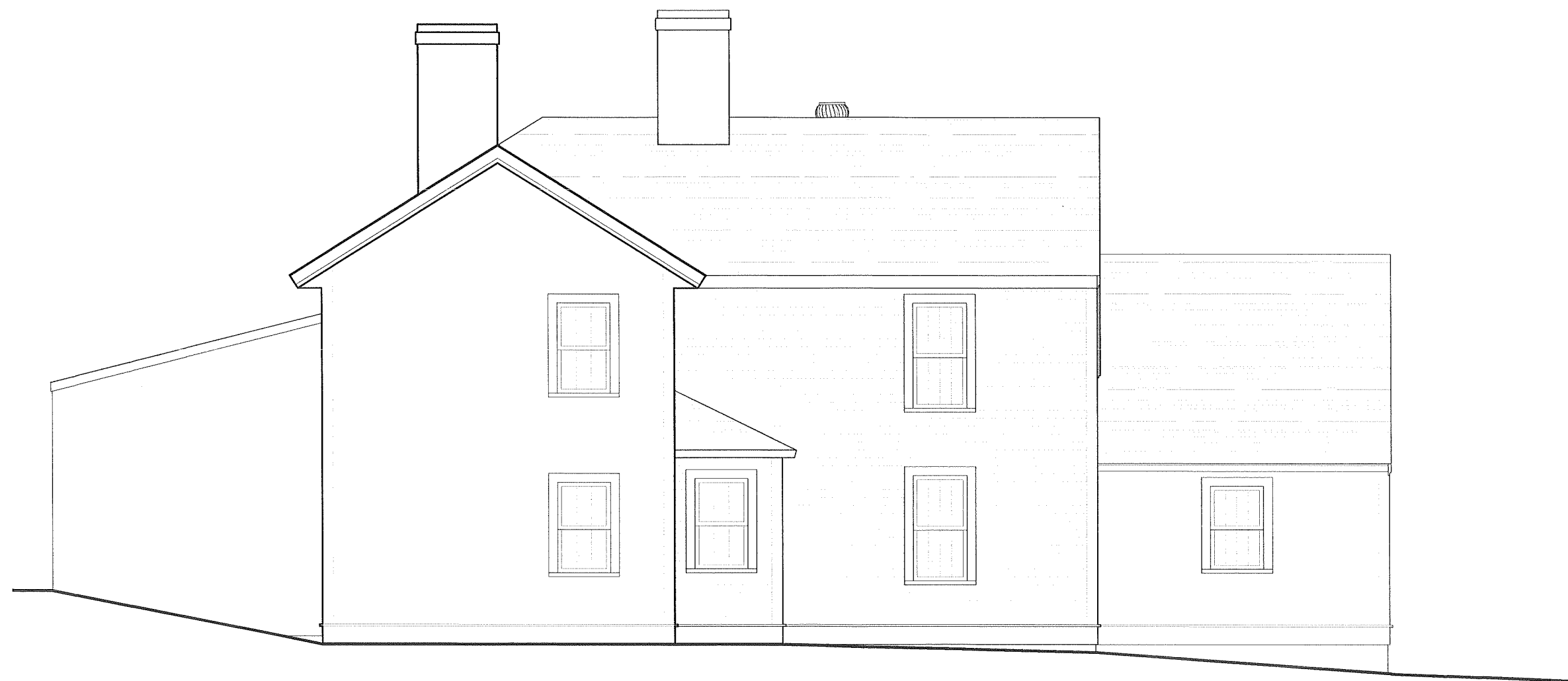
1 WEST ELEVATION - PROPOSED