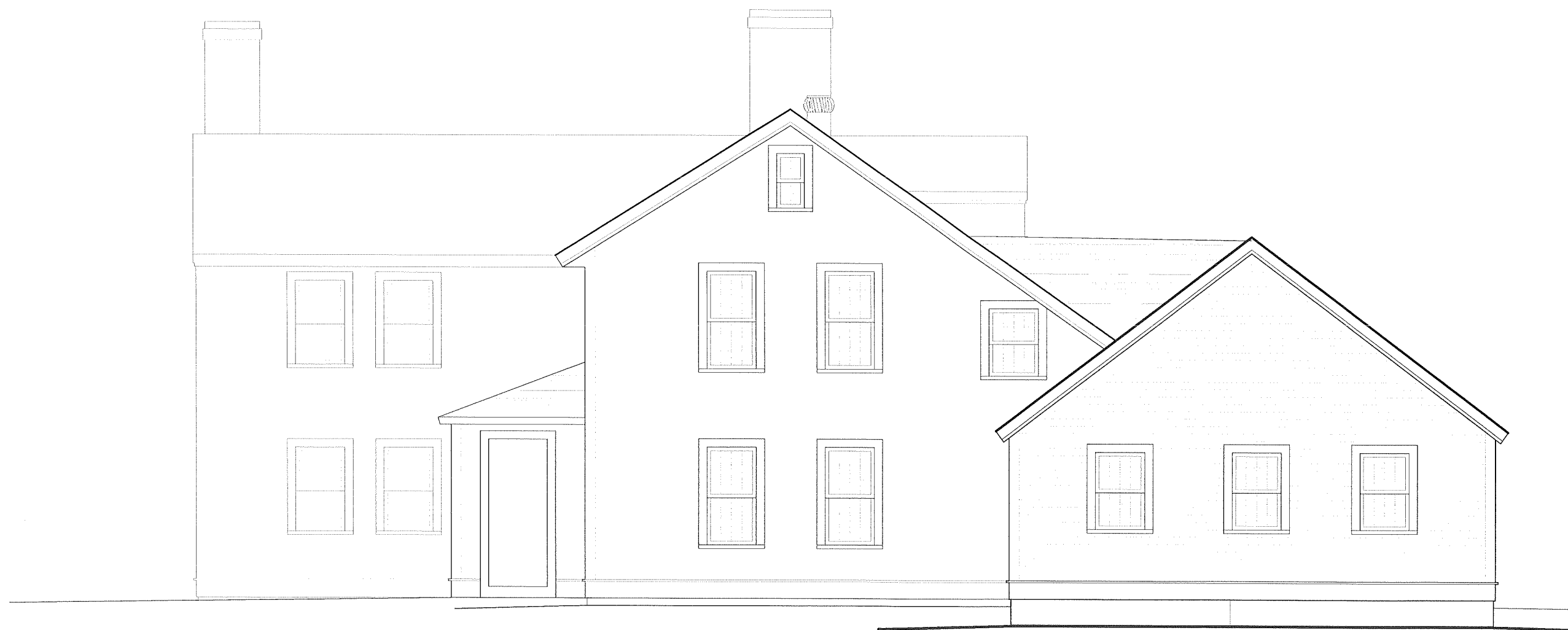
1 SOUTH ELEVATION - PROPOSED