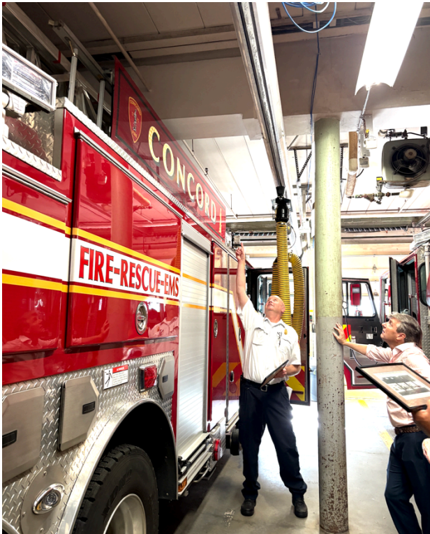
West Concord Fire Station, Ceiling height too low for many trucks