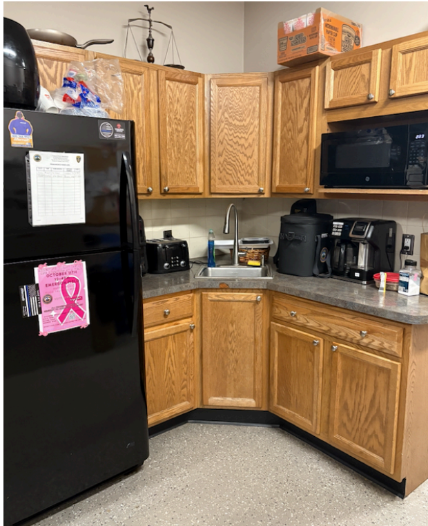
Walden Street, Dispatch Center (relocated from flood damaged area on 1 st floor)