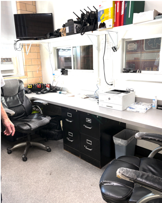
West Concord Fire Station, Staff Accommodations