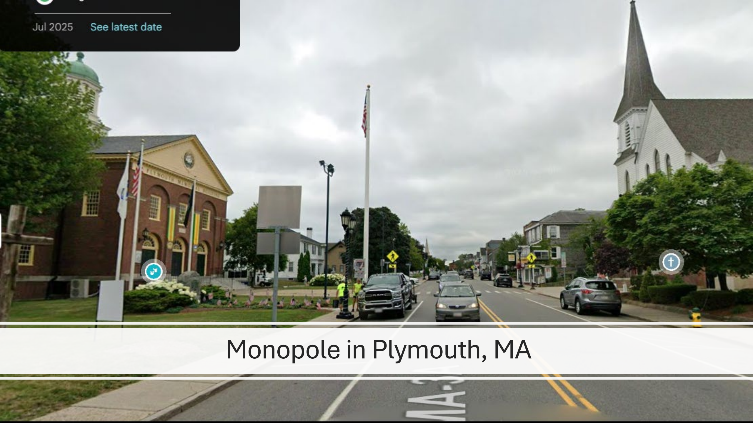
Monopole in Plymouth, MA