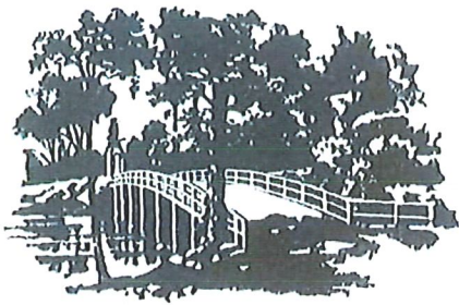
Old North Bridge