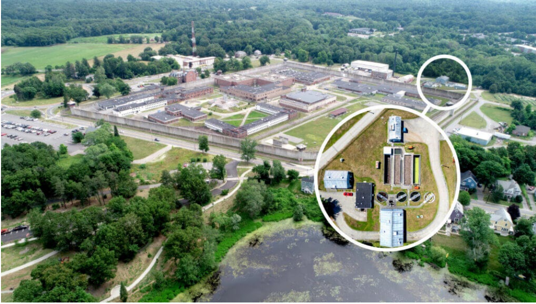
MCI Wastewater Treatment Facility