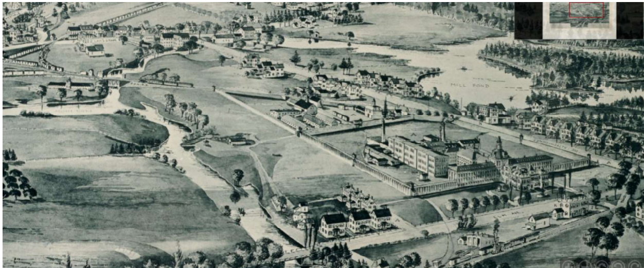
Concord Junction, 1893.

The Concord Prison and Reformatory helped drive the economic prosperity of West Concord in the late 19 th and early 20 th centuries. An idyllic 1893 bird’s eye view of Concord Junction featured the stately prison architecture as the gateway to the bustling area. Despite being walled off from society, this major feature in the landscape was connected to the larger world through a network of