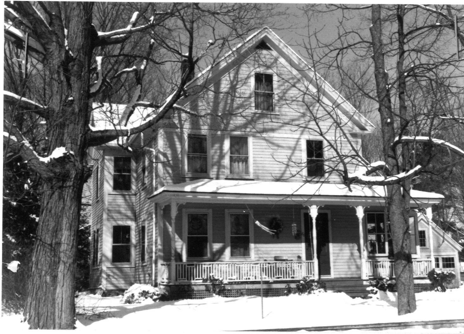
86 Grove Street (CON. 1785)