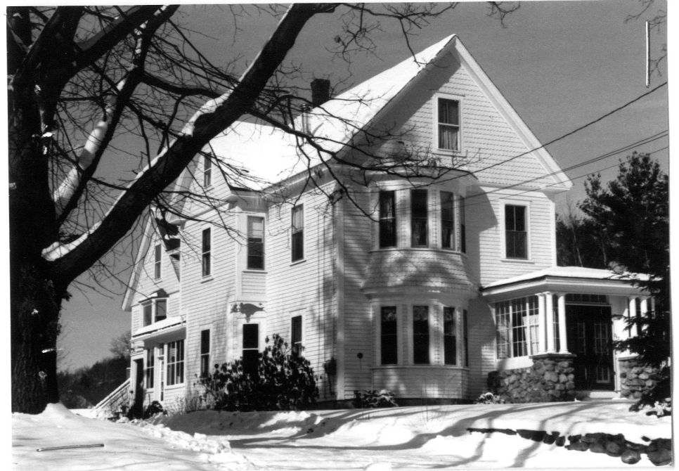
762 Barrett's Mill Road (CON. 1760)