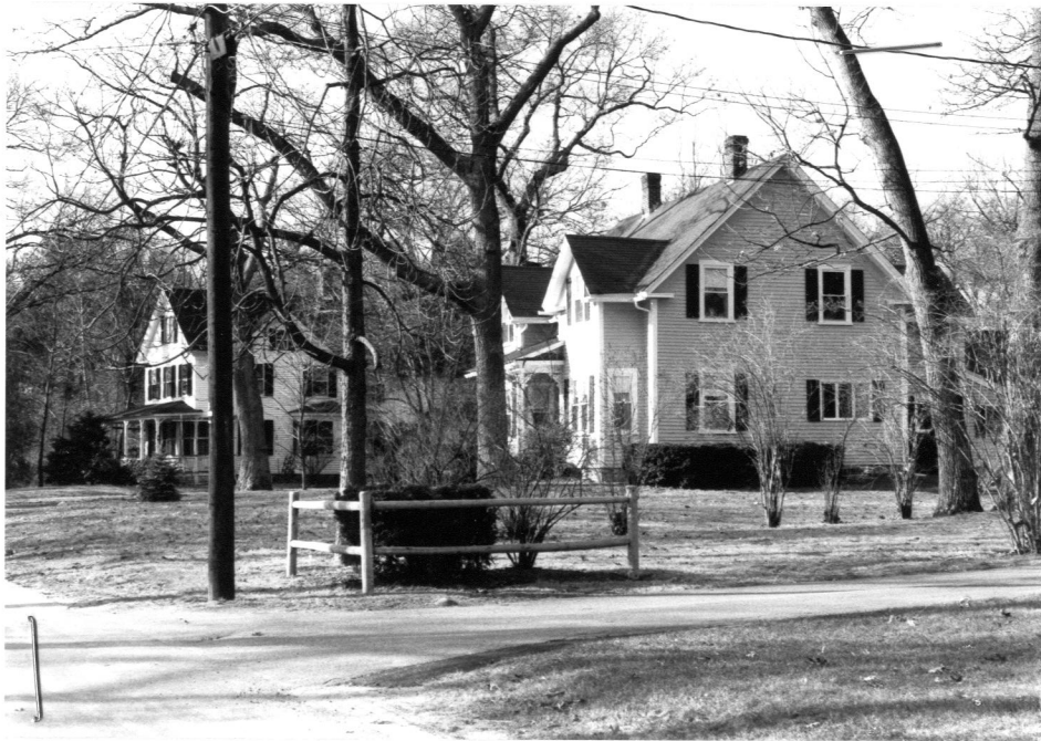
29 + 39 Assabet Avenue (CON. 1749 + CON. 1750)