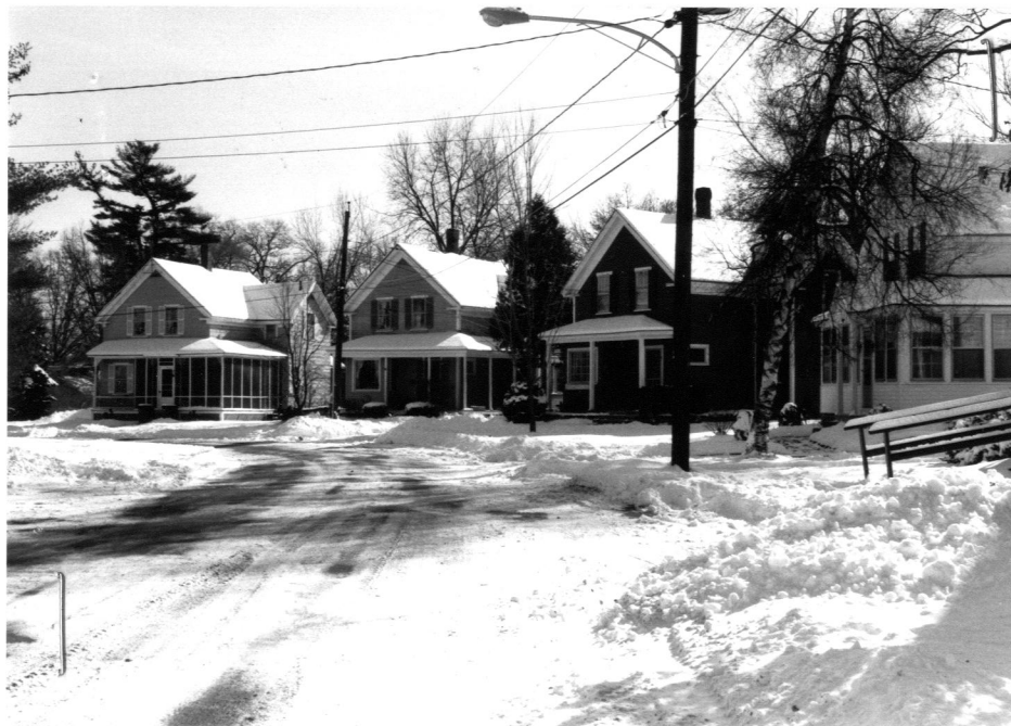
97-109 Grove Street