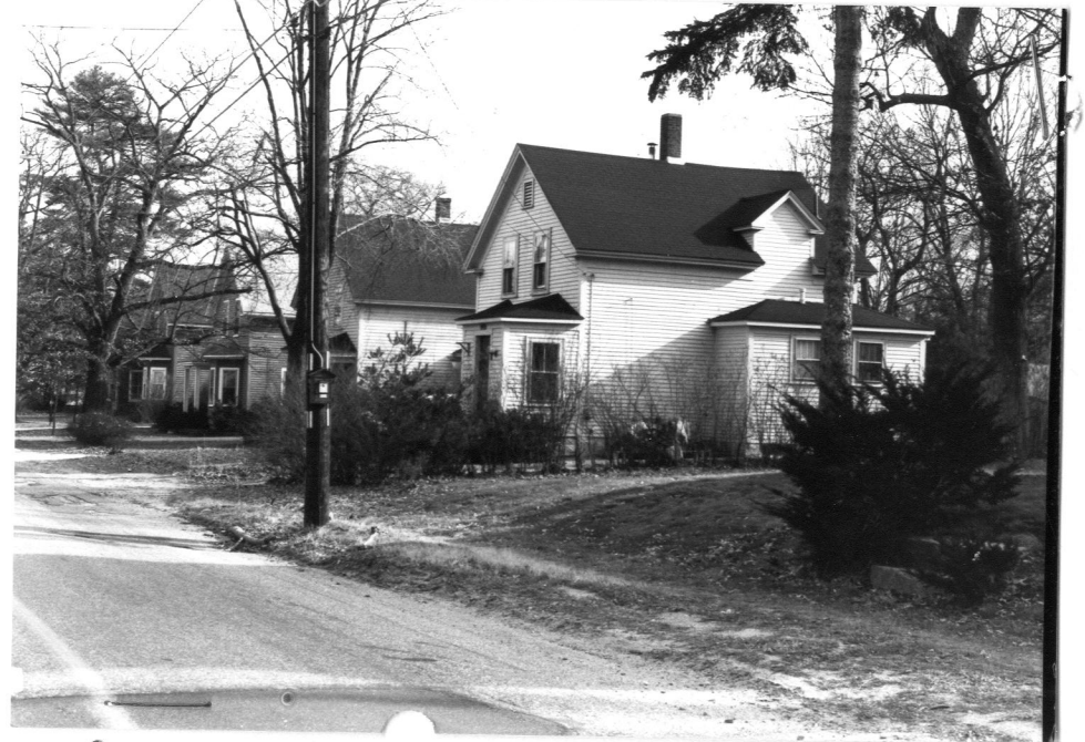
845-861 Barrett's Mill Road