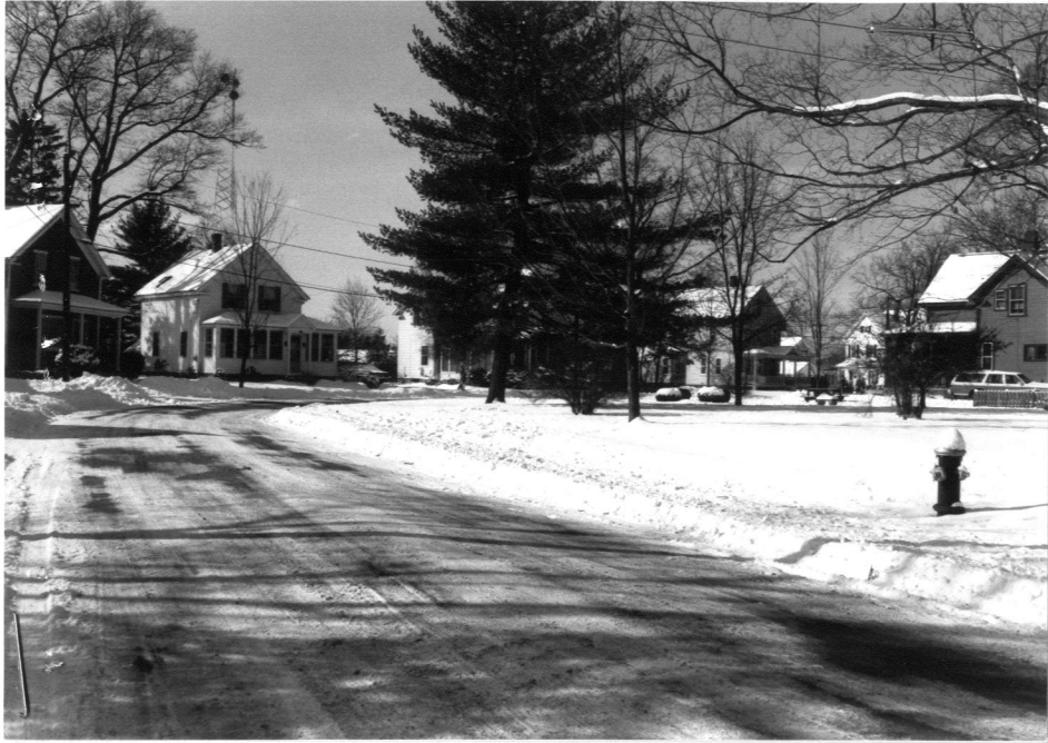
Grove Street, looking West