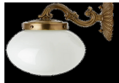
Tea Room Sconces