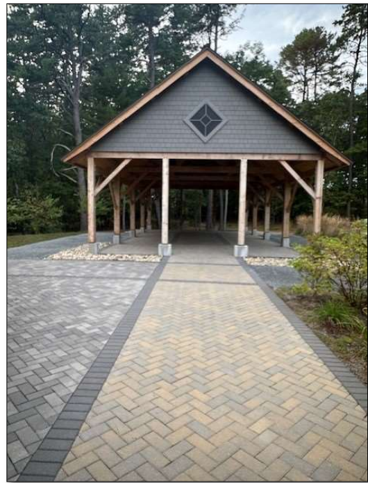
Gerow Park Pavilion

Gerow Recreation Area – The contractor, Cole, completed all work under their contract and has turned over the facility to the Town. They will return to complete punch list items and to address items under warranty as needed.