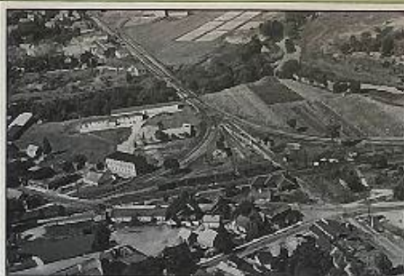
A lasting legacy was Concord Junction - now West Concord. Scattered communities coalesced around the railroad junction with its several factories, stores, worker housing, and its station serving both the F&L and Fitchburg lines. The village was renamed West Concord in 1928.

The route saw steady decline after the New Haven line was absorbed into the Penn Central line, and later the Conrail system. Only a segment from West Concord survived until the early 1990's and served several industries in Acton.