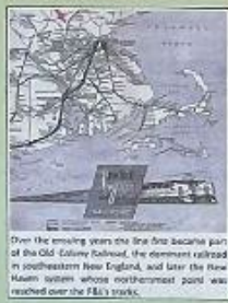
Over the ensuing years the line first became part of the Old Colony Railroad, the dominant railroad in southeastern New England, and later the New Haven system whose northernmost point was reached over the F&L's tracks.

Keep your eyes open - These are some of the railroad artifacts that you may see along the trail!