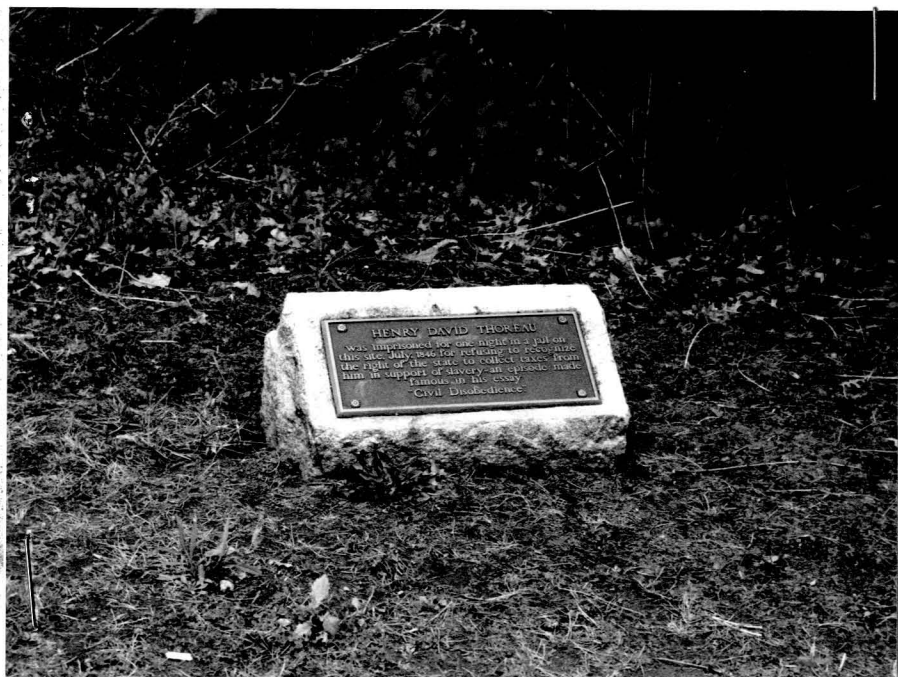
Thoreau / Jail Site Tablet (CON. 966)