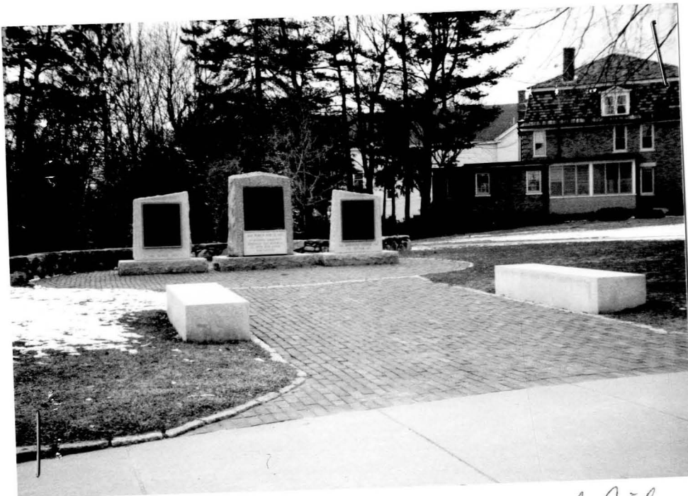
Site of Middlesex Hotel and Jail