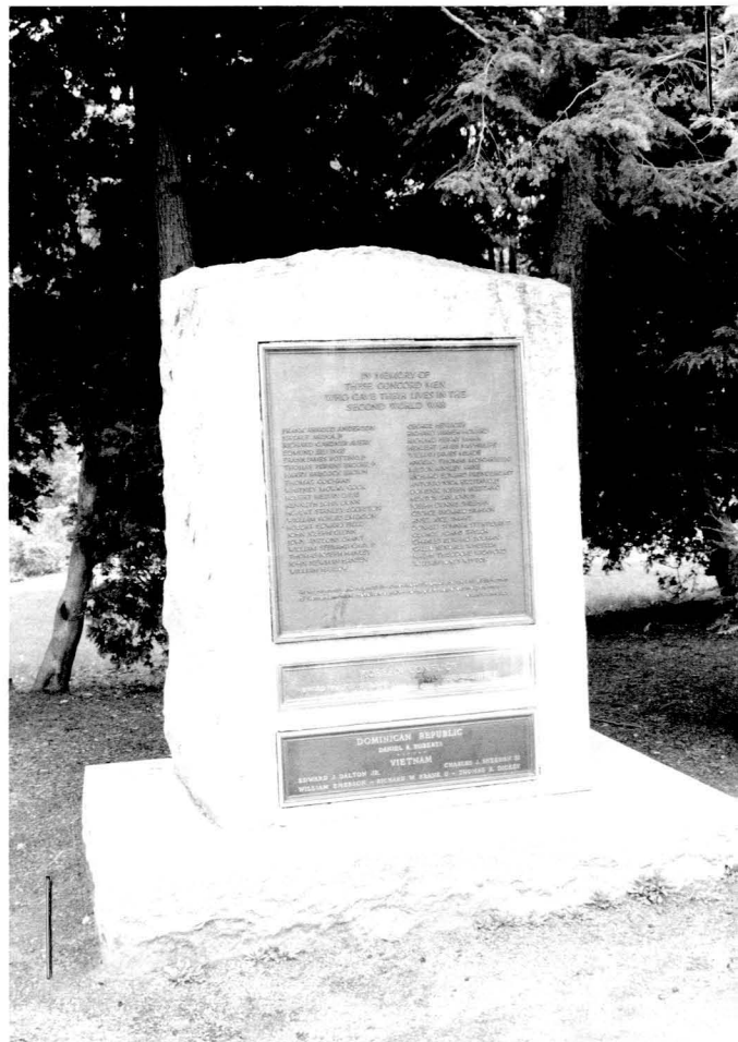
Vietnam Memorial (CON. 965)