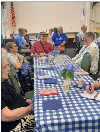
Waiting for the green light to head to the ice cream parlor.