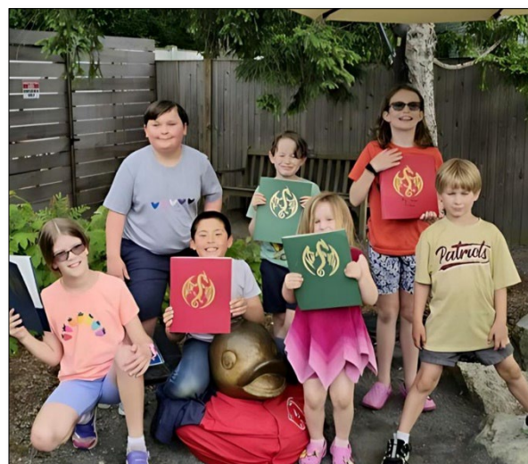
Photo of kids with their Reading Dragons Training Folders

Our June Director's Report is also available on the Library's website with further updates from the Library: https://concordlibrary.org/learn/about-us/directors-report