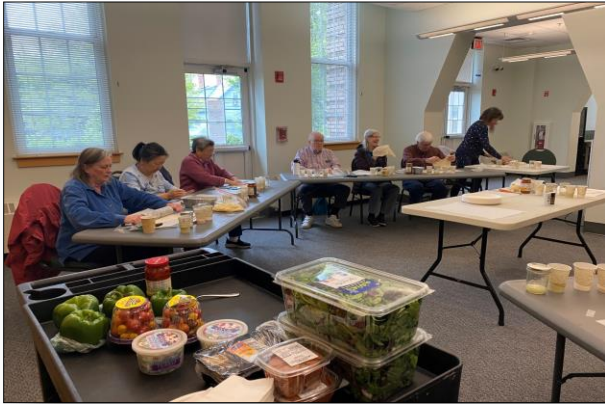
On May 16 the Clock Tower Room at HWCC turned into a teaching galley