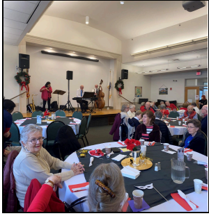
The auditorium was full of music, good food and fun.