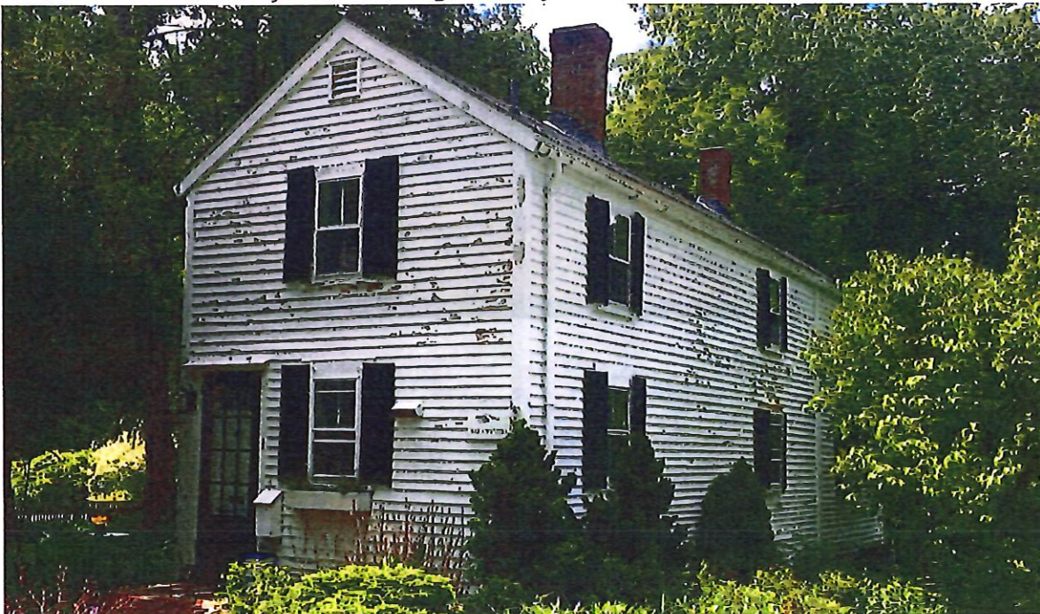
Widow Hoar House, 20 Lexington Road (ca. 1750) “One of the most unusual buildings in Concord,” the Widow Hoar House on the Church Green in Concord has an approximate date of 1750. Yet it is not listed as a witness house in the Battle Road Scenic Byway Corridor Management Plan. Was the omission an oversight or deliberate? It too deserves further study.