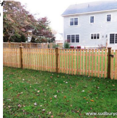
Wood Picket Fence (North/Right Side)