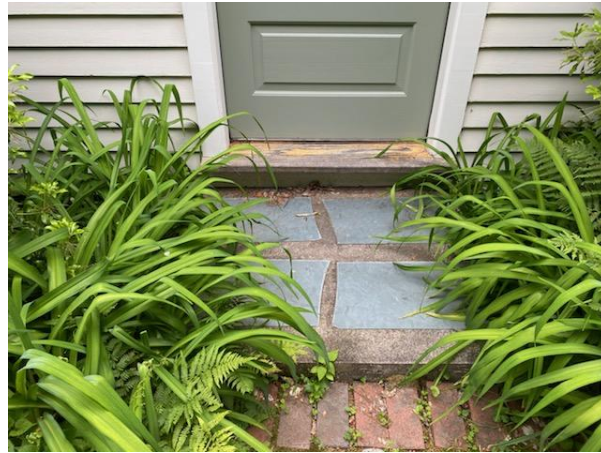
Current concrete step: 32'' x 45''

Proposing replacing step with grey granite step 32'' x 81'' (widening 18'' in either direction)