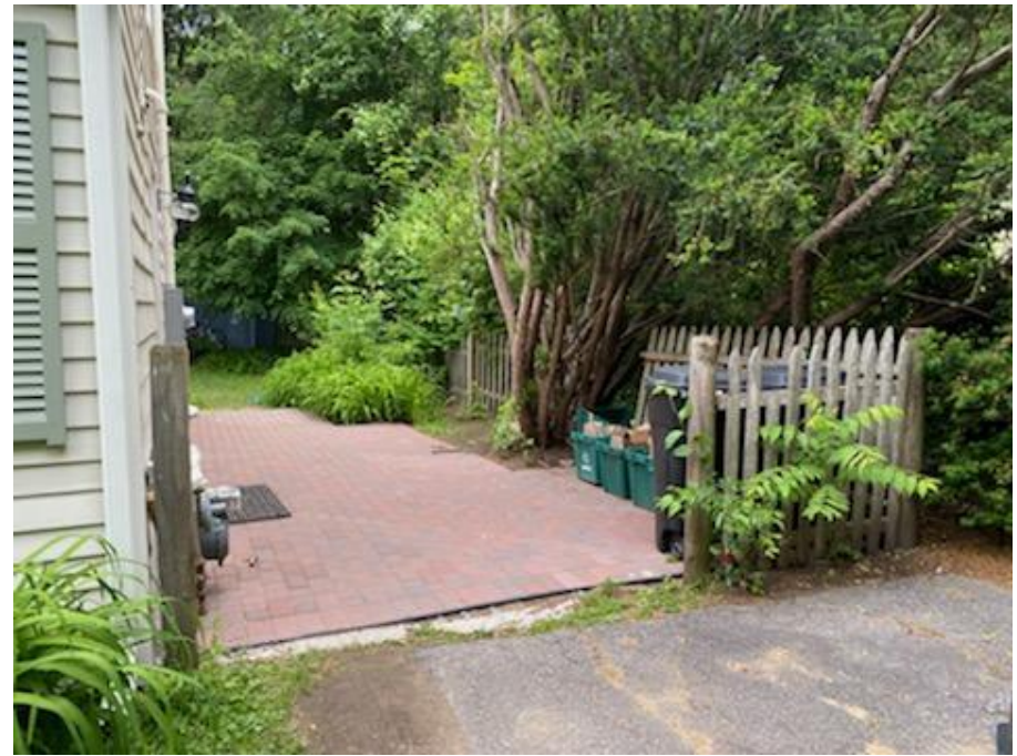
Current North/Right Fence and Gate