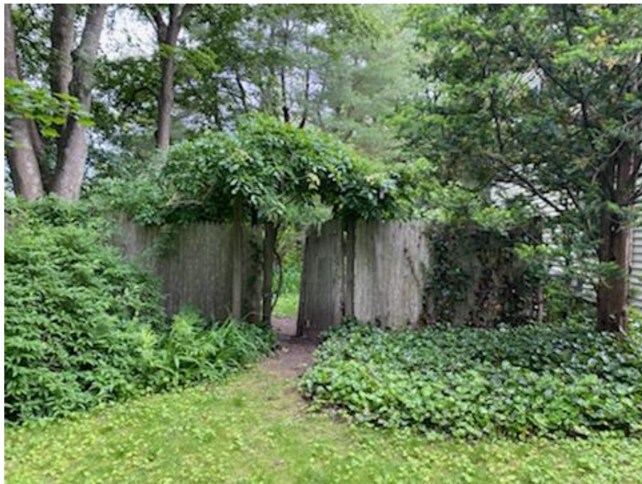
Current South/Left Fence and Gate