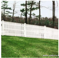
Wood Privacy Fence (South/Left Side)