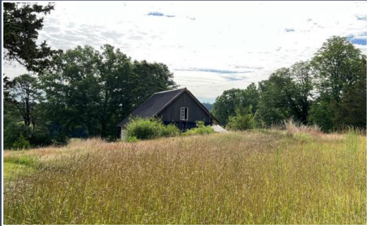
Finished New Construction