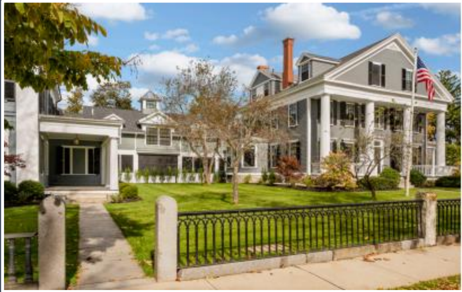
Main Street Elevation

Architect: DSK | Dewing Schmid Kearns Architects + Planners