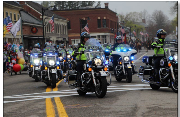
CPD with the NEMLEC motorcycle unit