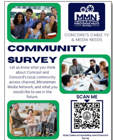
Community Survey Flyer with QR Code

These meetings allowed interested community members to learn about the Comcast franchise renewal. The Committee wants your opinions and ideas about cable TV and community media services that should be available in Concord as part of any new franchise agreement. Please complete the survey at the link. https://www.surveymonkey.com/r/Concord-Survey