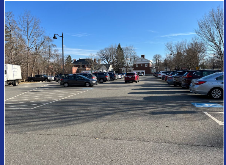
Main St Parking Lot