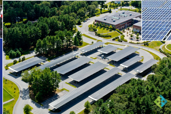
Lincoln Sudbury HS