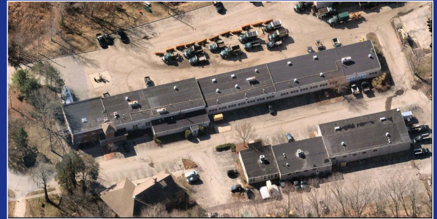
Public Works, Keyes Rd