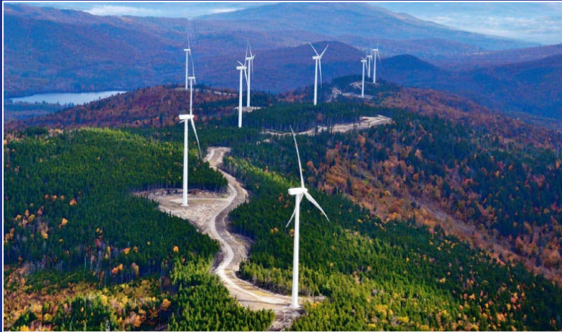
Spruce Mtn - Woodstock, ME