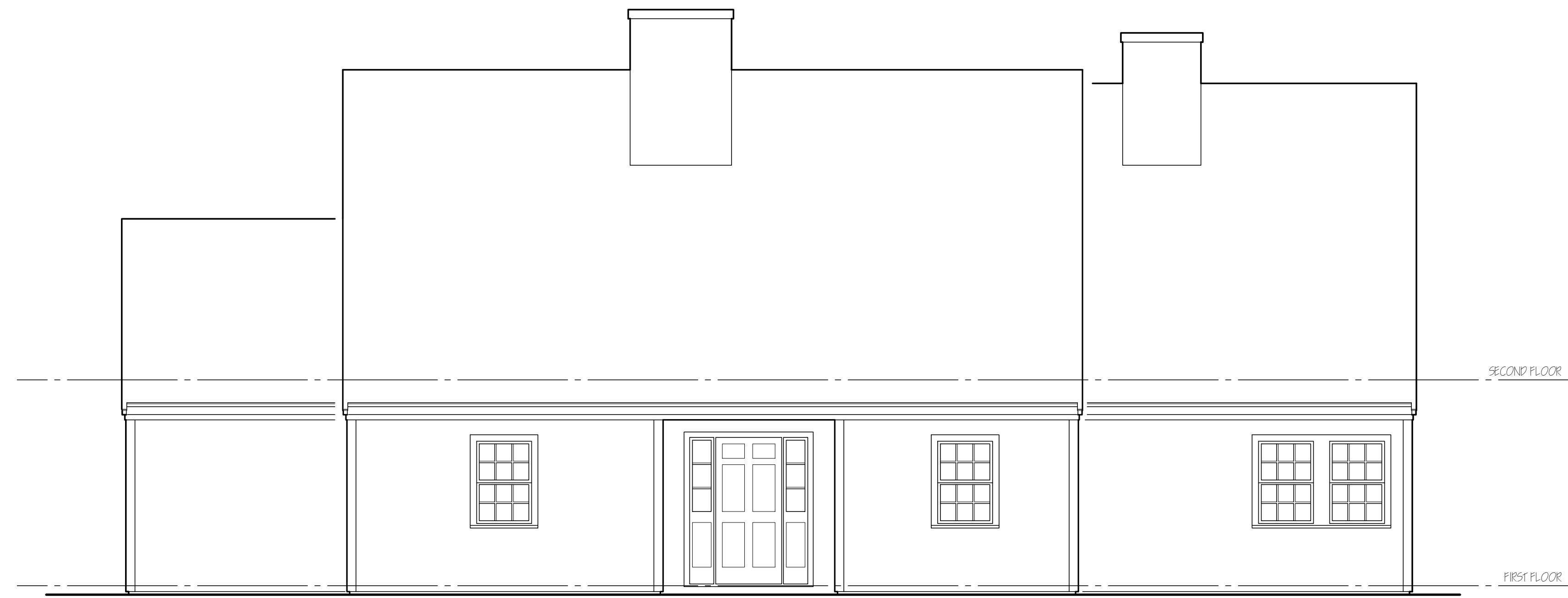
① EXISTING FRONT ELEVATION