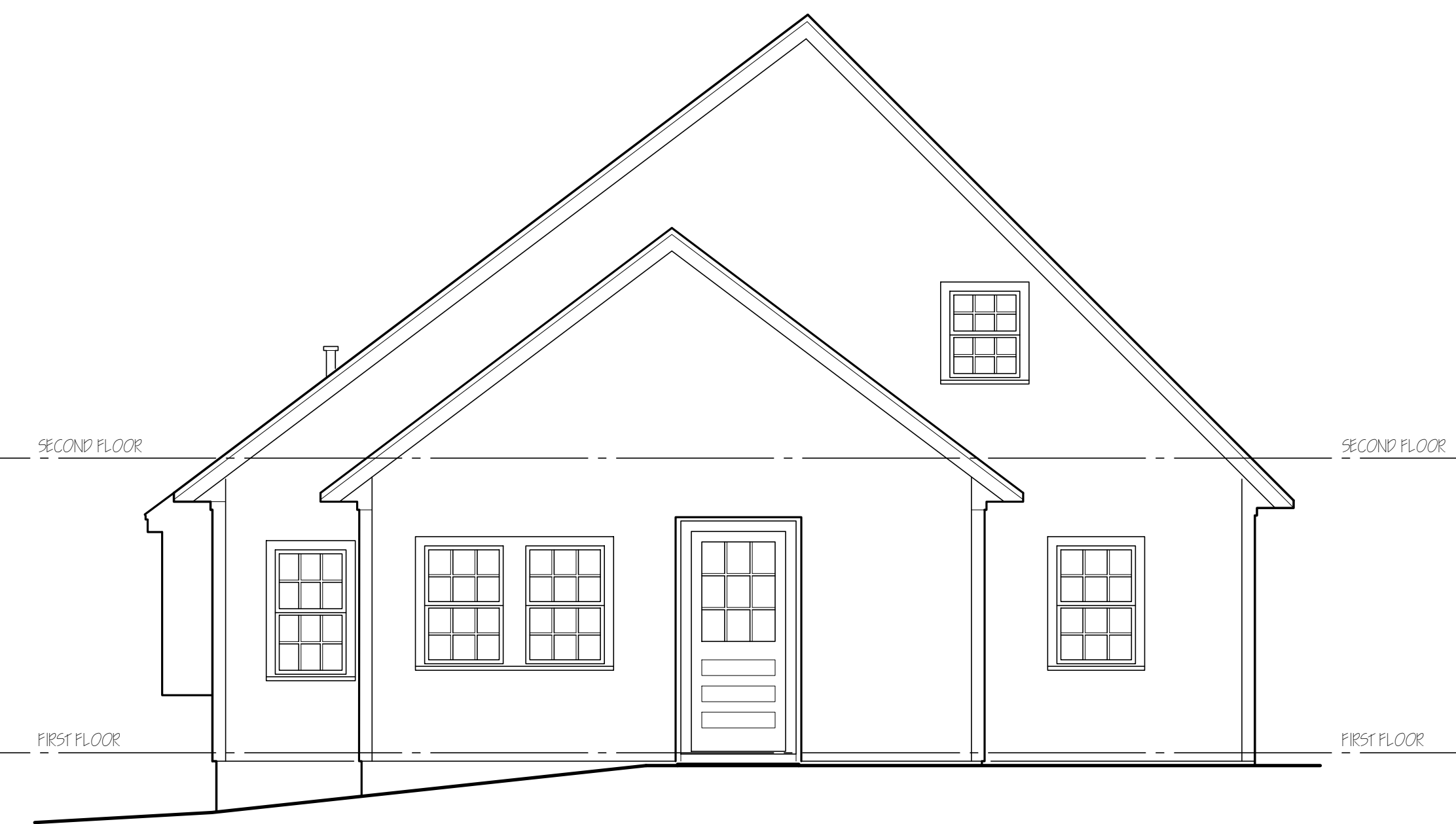
③ EXISTING LEFT SIDE ELEVATION