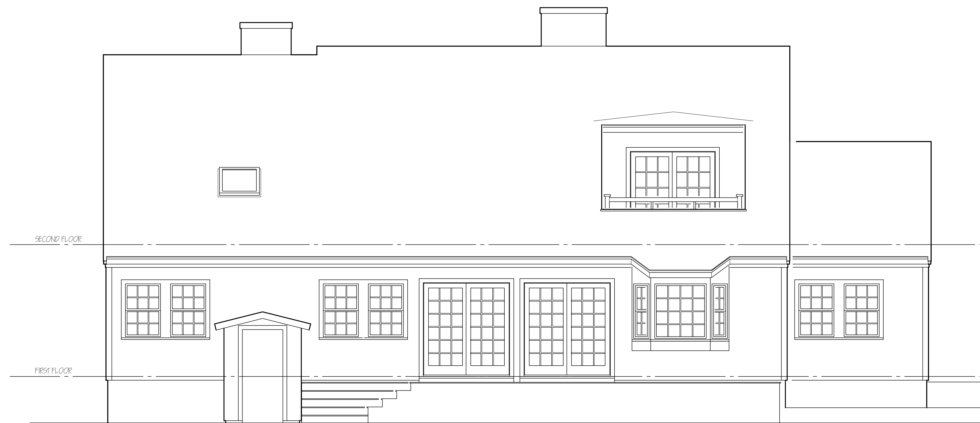
② EXISTING REAR ELEVATION