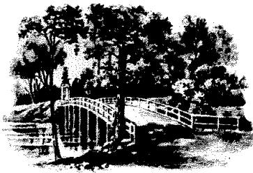
OLD NORTH BRIDGE