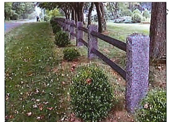
Granite Post and Wood Rail Image