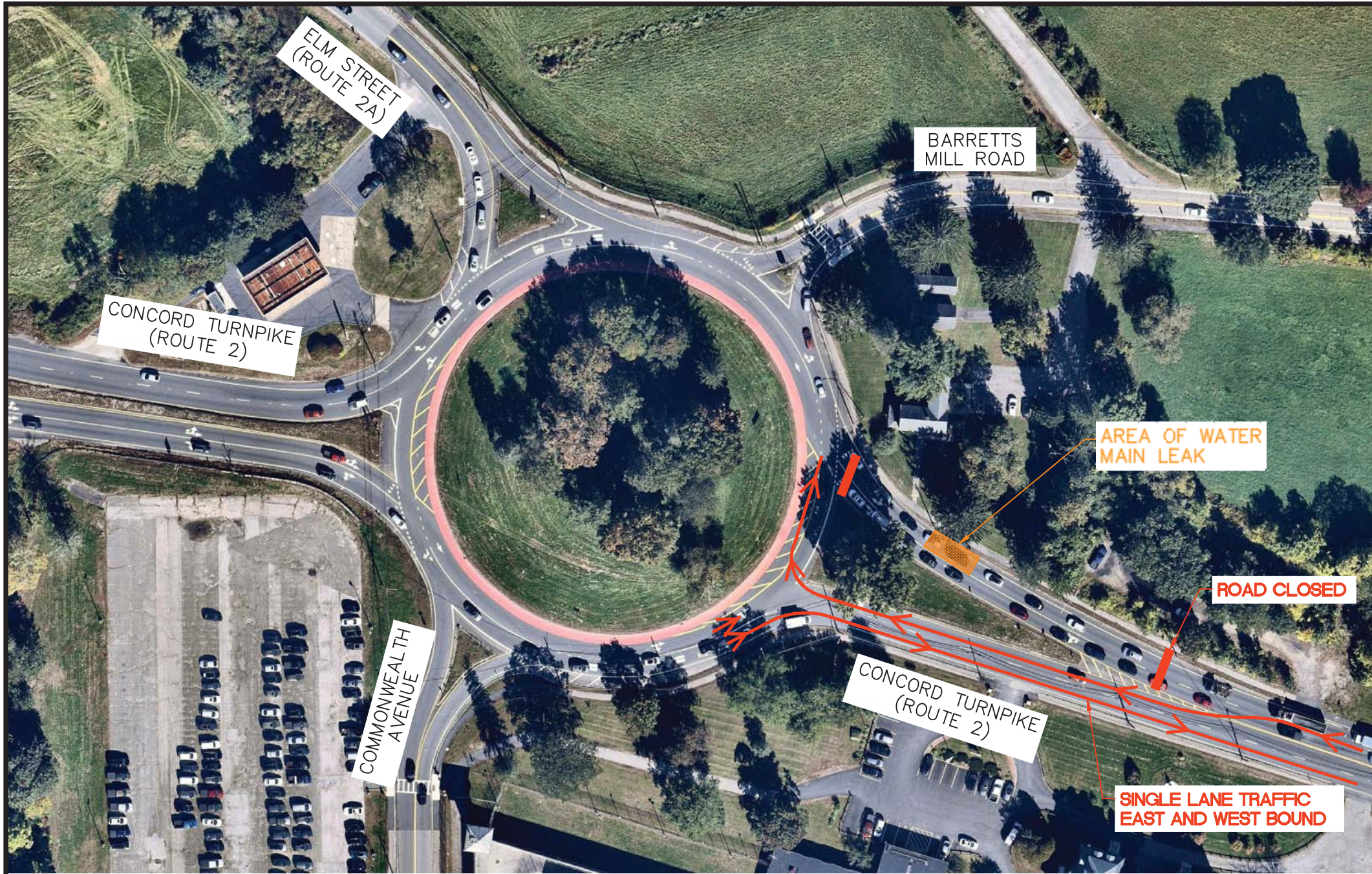
WORK AREA PLAN SCALE: 1" = 100'