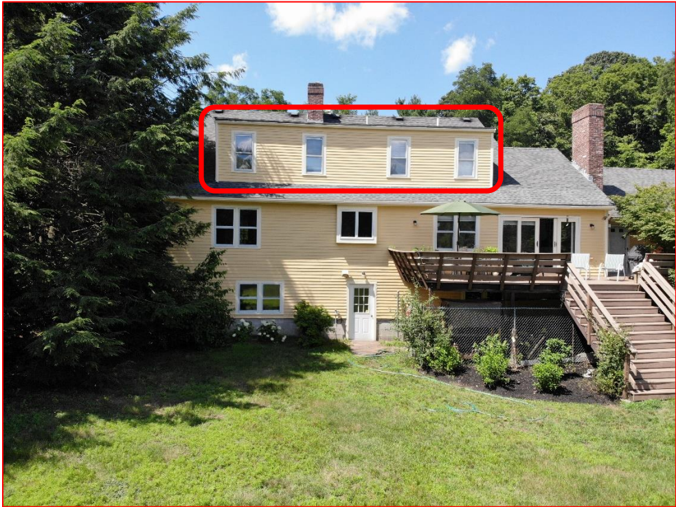
South facade. Windows to be replaced are highlighted in red.