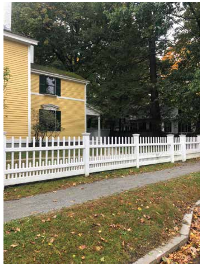
EXISTING FENCE ON MAIN ST, TO REMAIN