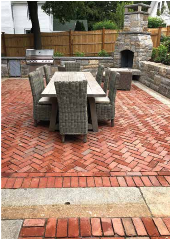
CITY HALL PAVER AND RECLAIMED GRANITE PAVING