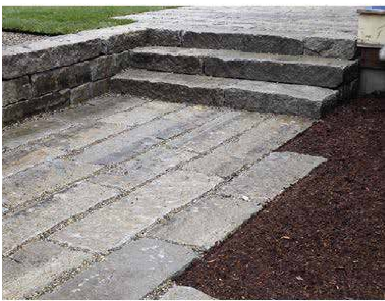
JUNIOR SLOPE CURB