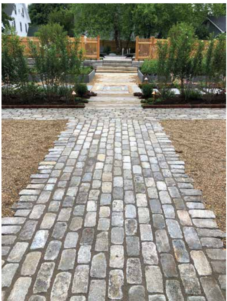
RECLAIMED COBBLESTONE AND PEASTONE