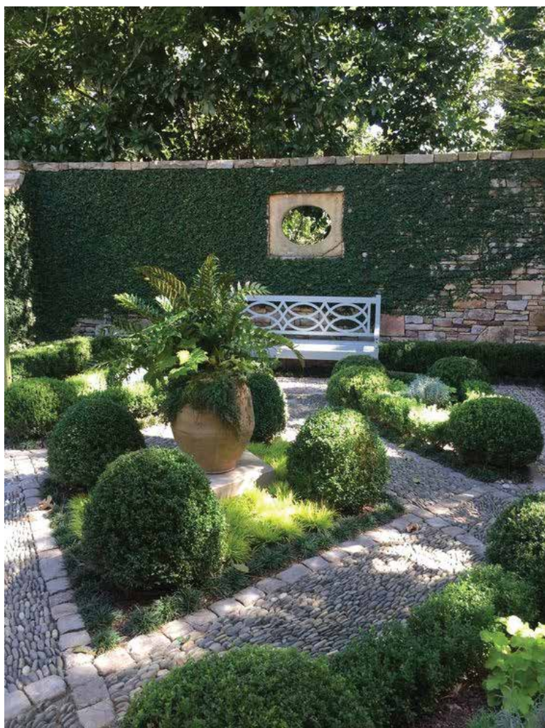
ENGLISH GARDEN CONCEPTS