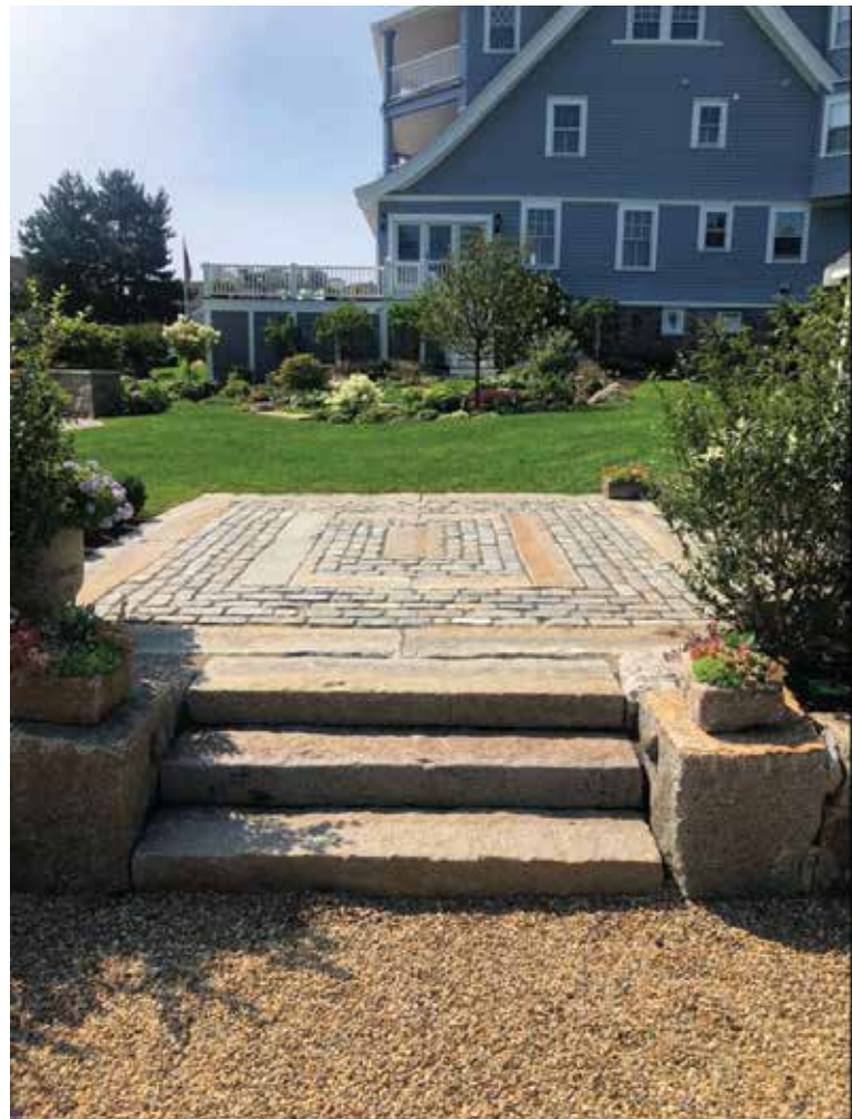
RECLAIMED GRANITE STEPS