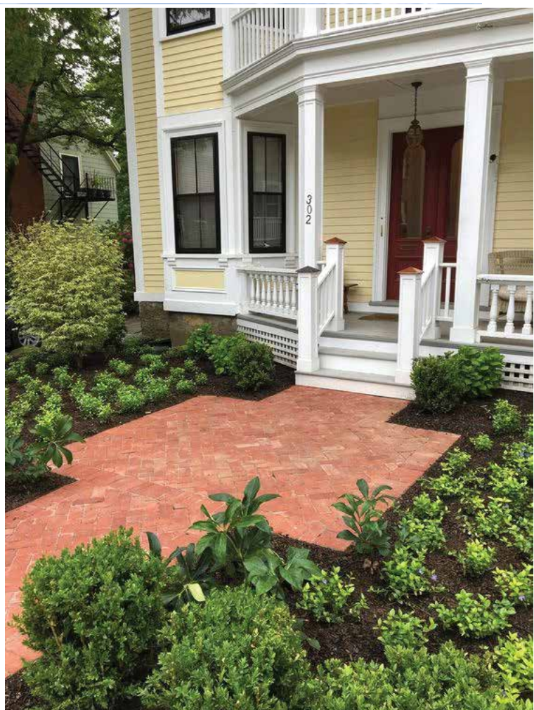
CITY HALL PAVERS AND GROUND COVERS, PERENNIALS