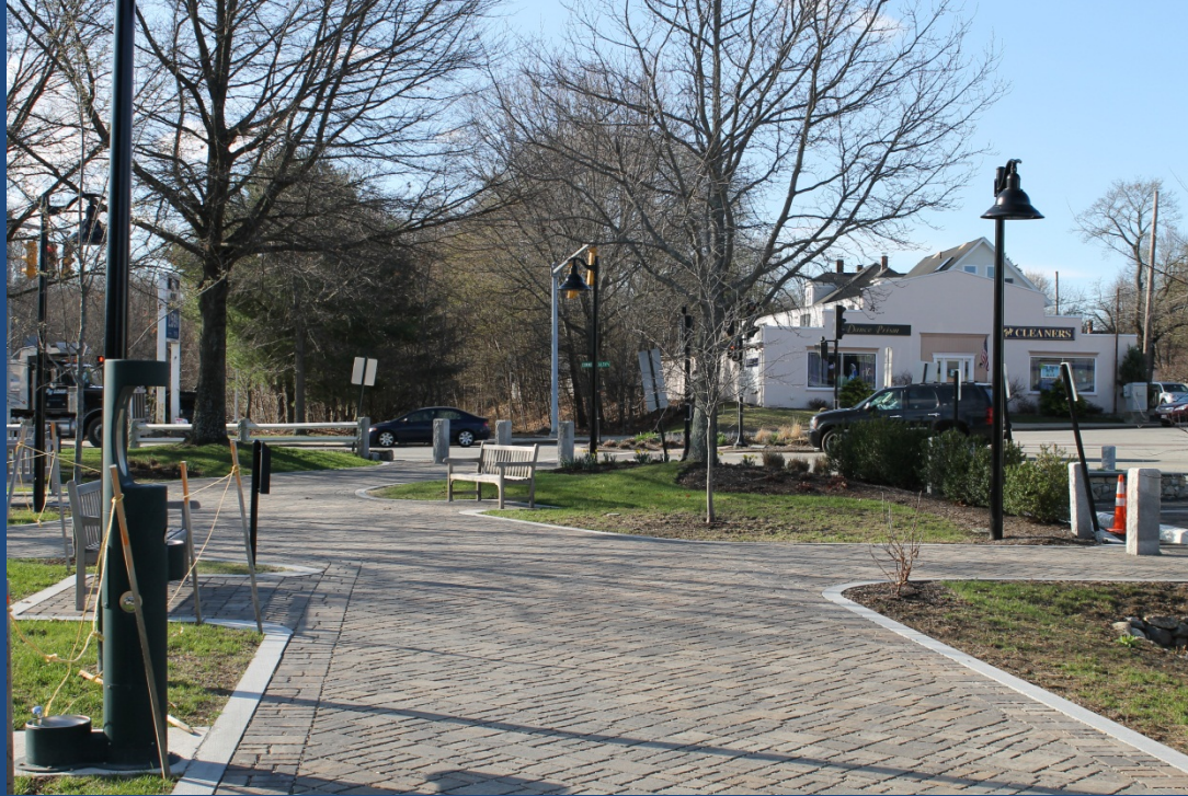
Rail Trail access through West Concord Junction Park