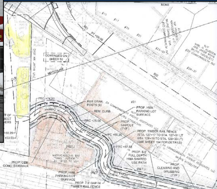
Easement behind Woods Hill Table for Rail Trail path