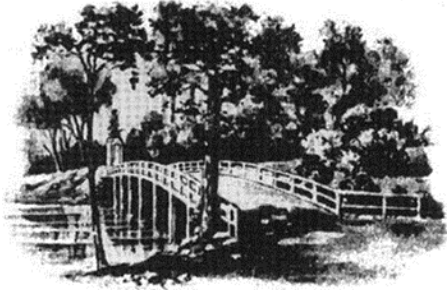
OLD NORTH BRIDGE