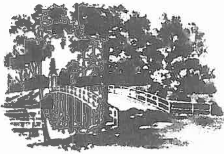
OLD NORTH BRIDGE