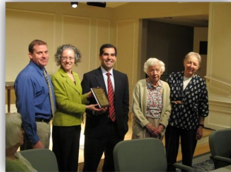
Newbury Court Staff and Green Committee Members Recognized by Concord Light for Completion of Lighting Upgrade

For more information on Concord Light’s high efficiency lighting rebates for businesses, click here or contact Jan Aceti at 978-318-3151 or jaceti@concordma.gov .